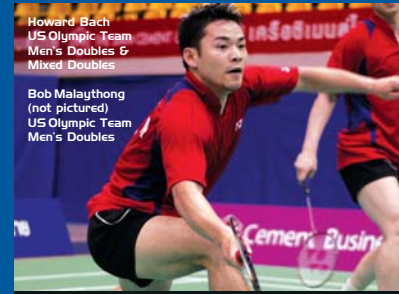
Howard Bach US Olympic Team Men's Doubles & Mixed Doubles

*Schedule subject to change depending on number of entries